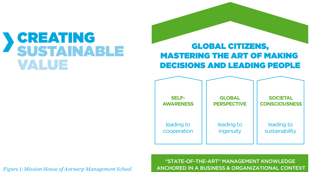
Figure 1: Mission House of Antwerp Management School

As the Mission states, Antwerp Management School aims to prepare future managers for key roles in the global business community and passionately promotes responsible management, entrepreneurship, sustainability, leadership and professionalism.